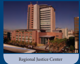
Regional Justice Center