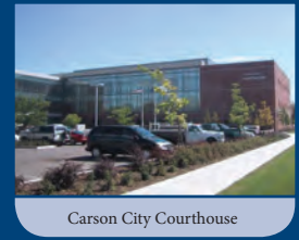
Carson City Courthouse